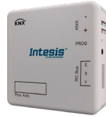
INKNXMID001I000 Commercial and VRF 1/16/64 Indoor Units