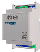
INBMSMID001I000 Commercial and VRF 1/ 4/8/32 Indoor Units