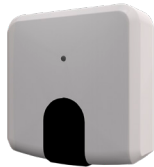
INKNXUNIO01I000 Universal IR AC 1 I.U. Binary Inputs